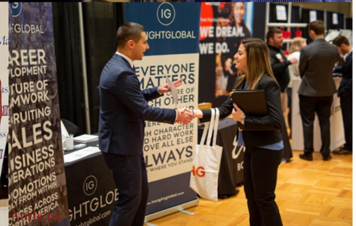
Isenberg School of Management